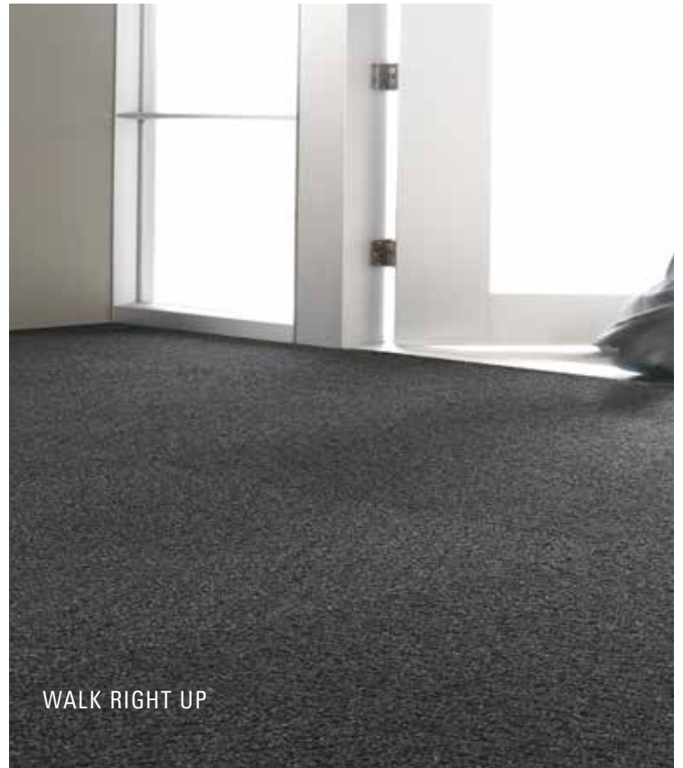
WALK RIGHT UP