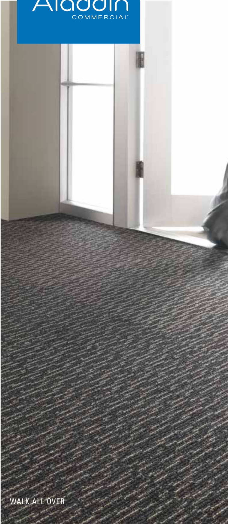
WALK ALL OVER