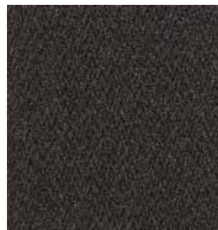
983 Walk the Walk