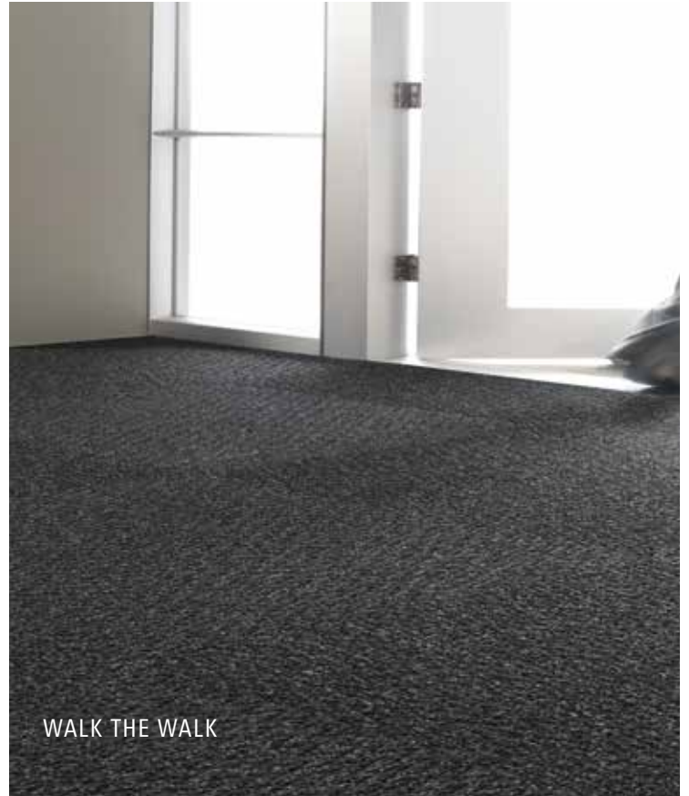
WALK THE WALK