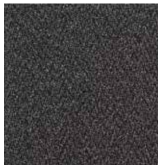
955 Walk the Walk