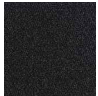
989 Walk the Walk