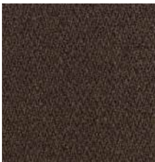
859 Walk the Walk

Cover: Walk All Over Carpet Tile 955 - Cobalt, Walk the Walk Carpet Tile 955 - Cobalt and Walk Right Up Carpet Tile 955 - Cobalt